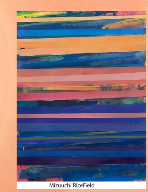
MichiyoRi Mizuuchi - Rice Field