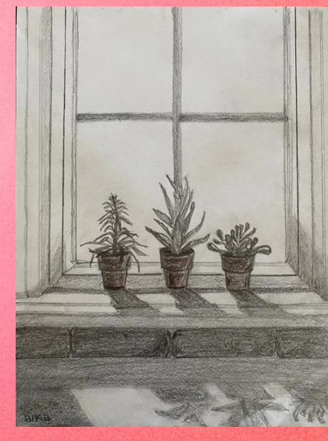
Alka Khana - Morning Light